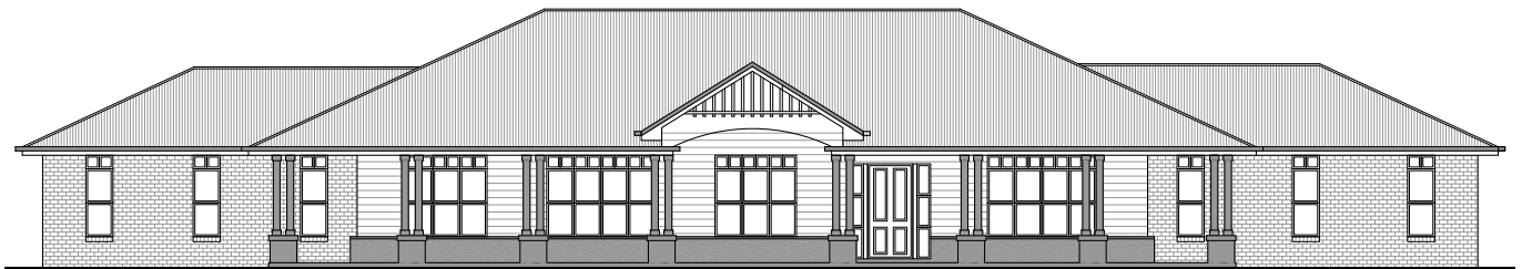
The Ridgeway 410 - Hamptons

DISCLAIMER: all information contained in this brochure should be used as a guide only. Please contact your Candor Homes Consultant for full details. ©Designs are protected by current copyright law under the Copyright Act 1968 (CTH) and moral rights under the Copyright Amendment (Moral Rights) Acts 2000 (CTH). Reproduction of these designs in any form is illegal.