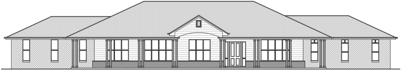
The Ridgeway 410 - Country