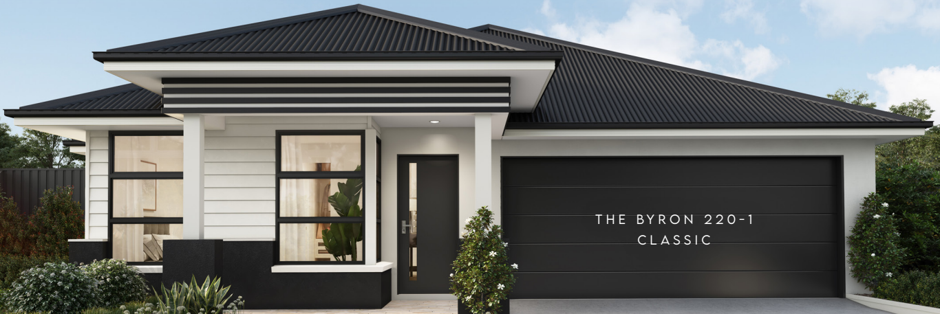
THE BYRON 220-1 CLASSIC