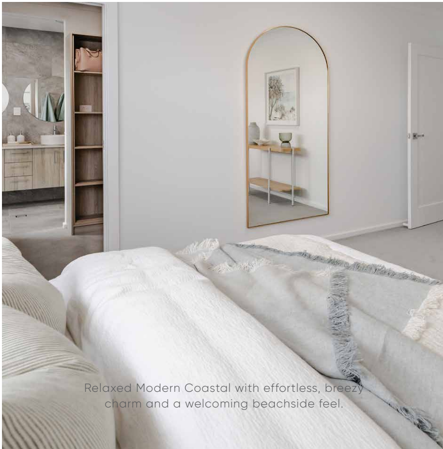
Relaxed Modern Coastal with effortless, breezy charm and a welcoming beachside feel.