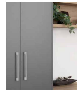
CABINERY Soft-close Polytec Matt