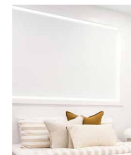
ROLLER BLINDS Throughout on all clear glass windows

COLOUR FINISHES MAY VARY BETWEEN RANGES AND PRODUCT SELECTIONS.