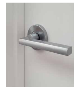
INTERNAL DOORS Hume flush door levers (4)