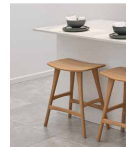
STONE BENCHTOP 20mm Stone Ambassador breakfast bar island