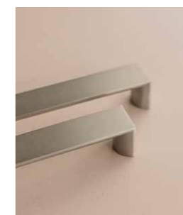
HANDLES Momo - colours, sizes and shapes variations (9)