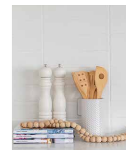
SPLASHBACK White subway tiles (3) matt or gloss