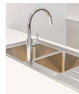
SINK & TAP Topmount stainless sink and Mizu Drift mixer