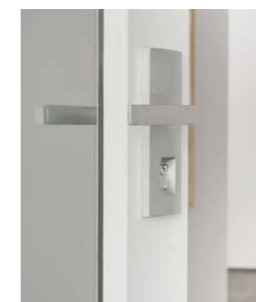
ENTRY DOOR Hume Door XN3 Gainsborough Trilock (4)