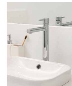
TAPWARE Mizu Drift - Bright Chrome straight or curved spout