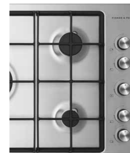
APPLIANCES 900mm Fisher & Paykel Series 5

With premium inclusions, thoughtful design and a wide choice of colours and materials, you can personalise your home to suit your style, with the confidence of proven quality and lasting design.