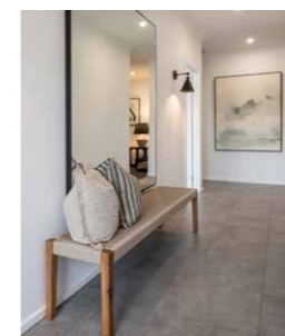
FLOORING Tiles to main, carpet to remainder