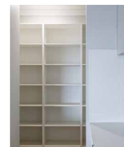
WALK-IN PANTRY Open white melamine shelving